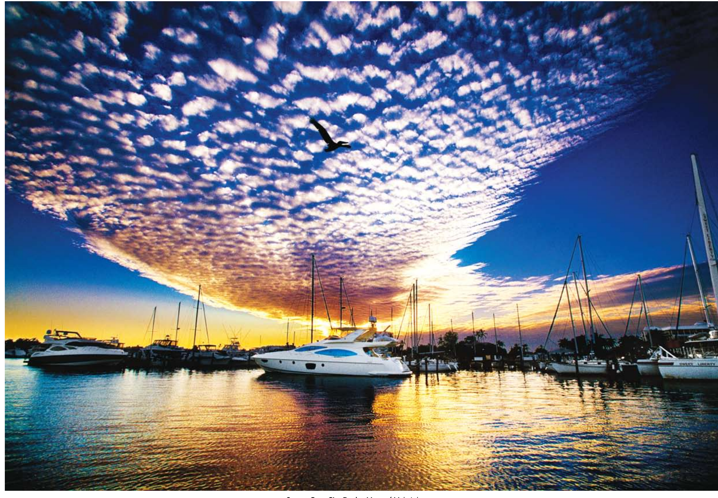
Sunset Over City Docks: Many of Maltz's best shots involve huge skies. But he says he doesn't intentionally seek out any particular look. "When I come upon a moment, I capture it," he says. "But for these shots I don't go out looking for it. I try to position myself to find something interesting."