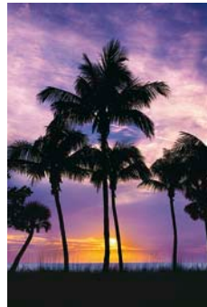
LOWDERMILK SUNSET 2

CREATE YOUR OWN EDITION AND DELIVER YOUR PERSONAL MESSAGE DIRECTLY TO YOUR CLIENTS