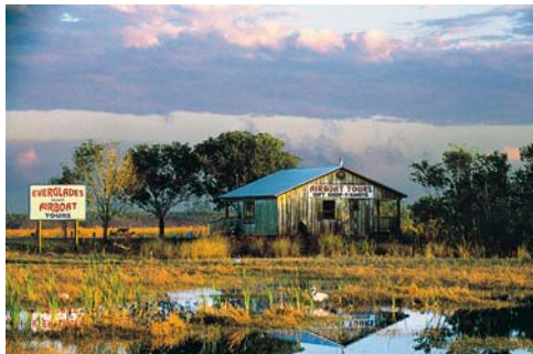
IN TIME PASSING

Journey Through Paradise is also ideal for special occasions, corporate incentives, openings, meetings and conventions, guest amenities, and donor thank-you's.