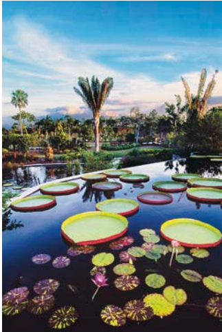
GARDEN OF DREAMS