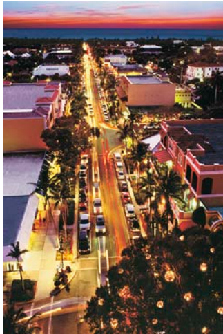
FIFTH AVENUE OVERVIEW