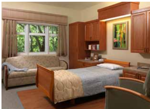
A patient room at Brookside

Outside and inside, Brookside is a place of beauty, comfort and peace. The large two-story residence is set back in the serenity of nature, surrounded by majestic trees and natural protected wetlands. Its backyard winding boardwalk is perfect for a stroll or wheelchair ride to admire the habitat. There also are several outdoor sitting areas and an outdoor sanctuary adorned with vibrant stained glass panels.