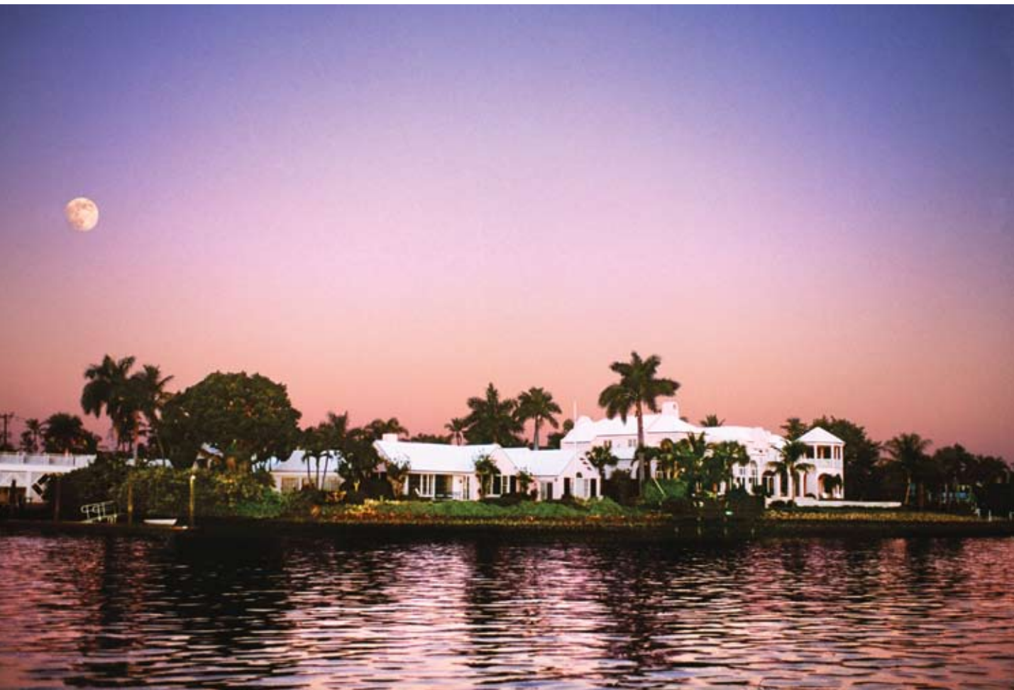
Under a Setting Moon: "This was taken just a few minutes before Sunrise at Marker 15 ," he says. "I was going out to get shots on Keewaydin, but these two images happened before I even got to my destination. I would say that happens all the time."